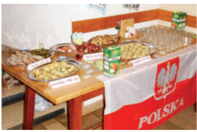
Part of the European dinner, prepared by the participants